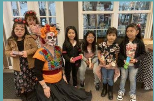
Day of the Dead