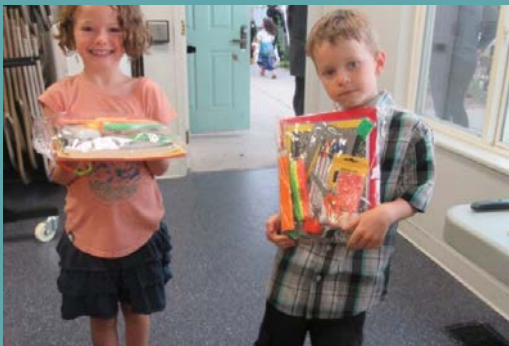
School Supplies Give-Away