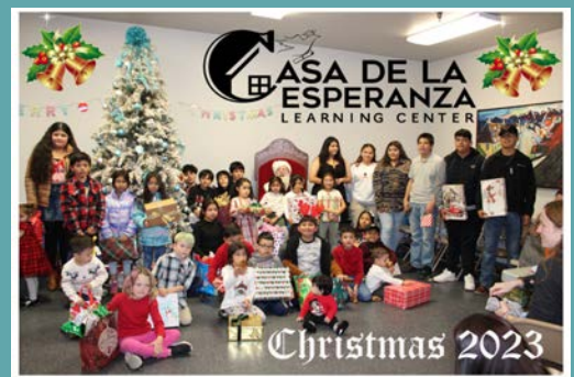
Christmas 2023 Christmas Posada